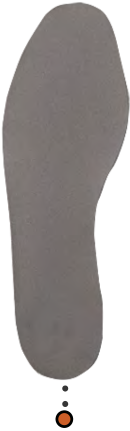
Mid-Plate STAINLESS STEEL