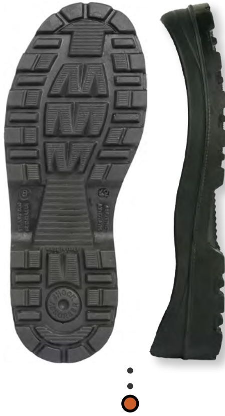
Sole SOLAGRIP SRC polyurethane double density